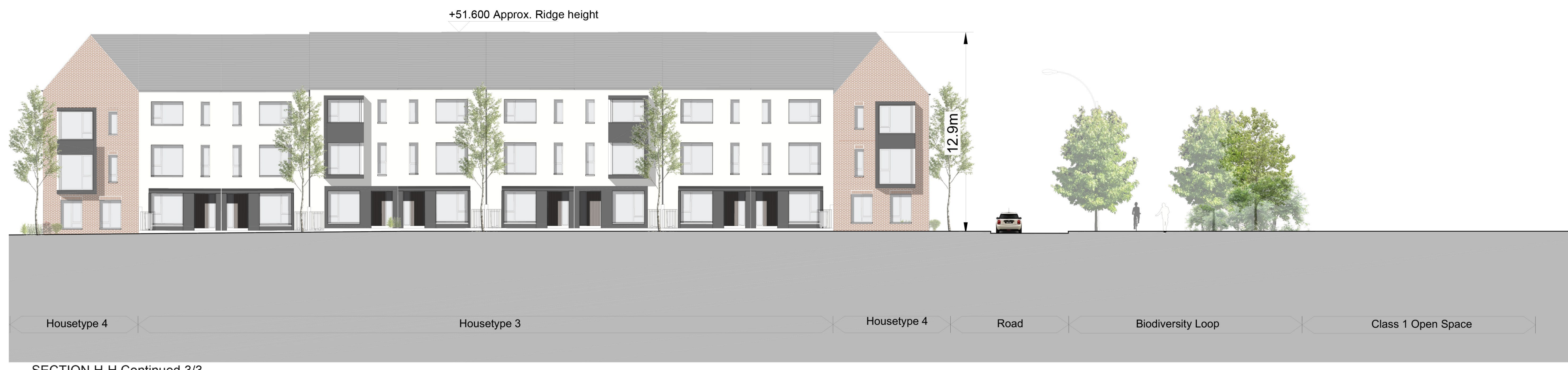
SECTION H-H Continued 3/3