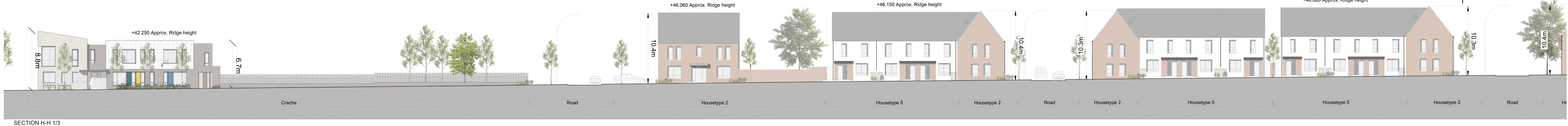
SECTION H-H 1/3

This drawing is copyright 1. Do not scale this drawing 2. Times and positions to be immediately notified to the Architect 3. All dimensions to be checked on-site